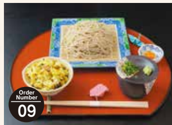
Order Number 09 Soba Set with Mustard Greens (Buckwheat noodles) そば御膳 (高菜めし付) ¥1,300