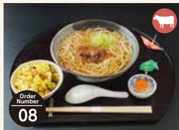
Order Number 08 Aka-ushi Soba Set with Mustard Greens (Buckwheat noodles with beef from Japanese Brown cattle) あか牛そば御膳 (高菜めし付) ¥1,900