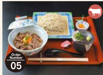
Order Number 05 Aka-ushi Sukiyaki Don Set (Simmered beef from Japanese Brown cattle in a sweet sauce served on a bowl of rice) あか牛すき丼御膳 ¥2,500