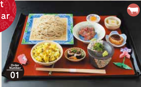
Order Number 01 Hanare Set (with Mustard Greens) はなれ御膳 (高菜めし付) ¥3,200