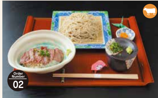
Order Number 02 红牛肉盖饭御膳 赤牛丼御膳 아카규 소고기 덮밥 세트