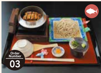
Order Number 03 Unagi Kamameshi Set (Eel with rice cooked and served in a small iron pot) うなぎ釜飯御膳 ¥3,000