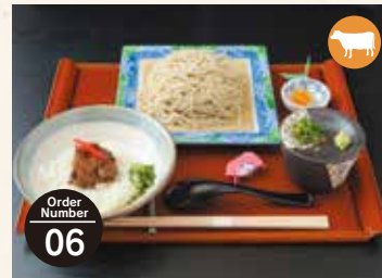
Order Number 06 牛肉盖饭御膳 牛肉飯御膳 소고기 밥 세트