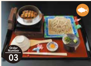
Order Number 03 小锅什锦鳗鱼饭御膳 鰻魚釜飯御膳 장어 가마솥밥 세트