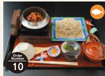
Order Number 10 鳗鱼饭三吃小锅什锦饭御膳 蒲燒鰻魚釜飯御膳 히츠마부시 (장어를 잘게 썰어 섞은) 가마솥밥 세트