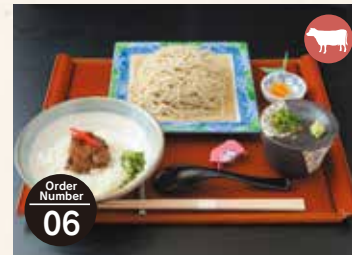
Order Number 06 Beef Bowl Set 牛めし御膳 ¥2,300