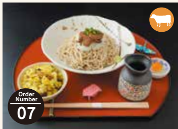
Order Number 07 姜末、花椒煮红牛御膳 (送雪菜拌饭) 赤牛時雨御膳 (附芥菜飯) 아카규 시구레(소고기 조림) 세트(갓나물 밥 곁들임)