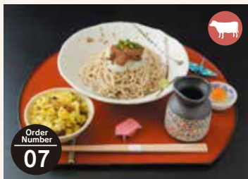
Order Number 07 Aka-ushi Shigure Set with Mustard Greens (Beef from Japanese Brown cattle simmered with ginger and soy sauce) あか牛しぐれ御膳 (高菜めし付) ¥1,900