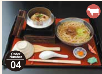
Order Number 04 Aka-ushi Suji Kamameshi Set (Beef tendons from Japanese Brown cattle with rice cooked and served in a small iron pot) あか牛すじの釜飯御膳 ¥2,700