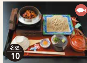
Order Number 10 Hitsumabushi Kamameshi Set (Finely chopped eel with rice cooked and served in a small iron pot) ひつまぶし釜飯御膳 ¥3,200

A separate venue of the famous restaurant Waremokou on Soba Street. We serve original soba cuisine and food using the famous brand of Aso beef called Aka-ushi. Fully private rooms are available. Enjoy a relaxing meal.